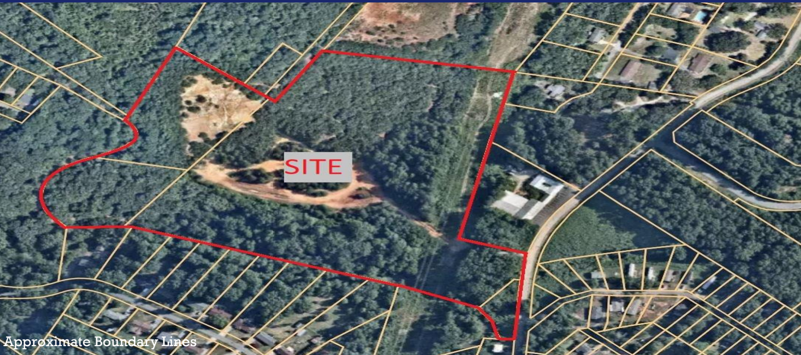
Approximate Boundary Lines